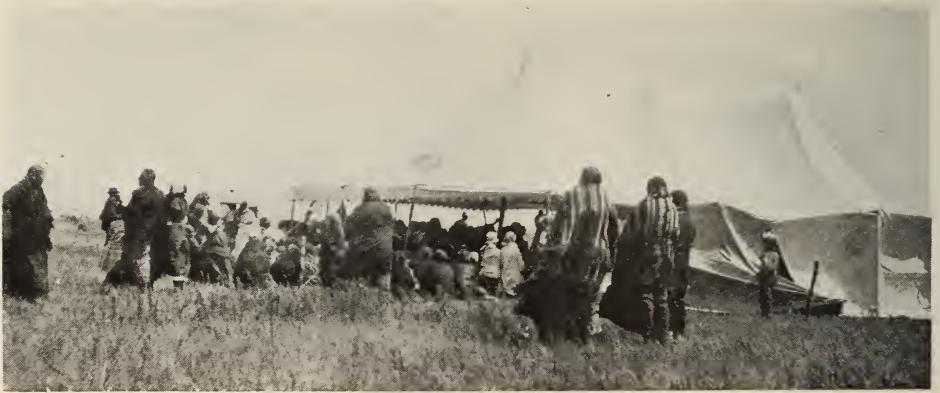
Women's tent while the offering was being taken